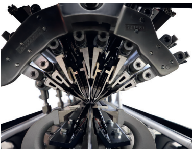
RDJ 6/2 EN knitting elements RDJ 6/2 EN成圈机件